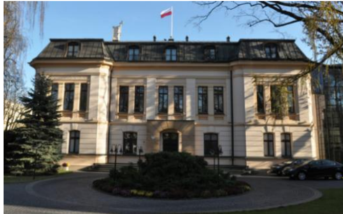
Poland's Constitutional Tribunal: 15 judges