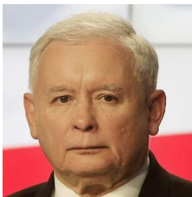
Party chairman (PiS) Jaroslaw Kaczynski