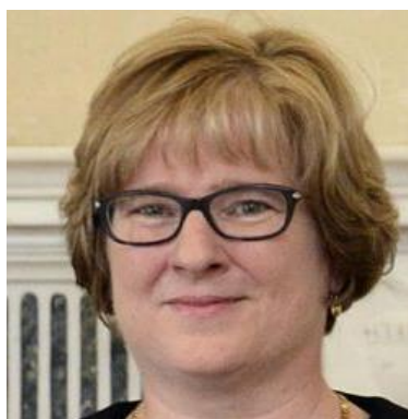
Irish High Court judge Aileen Donnelly