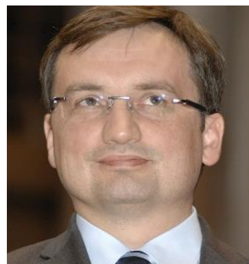
Minister of Justice Zbigniew Ziobro