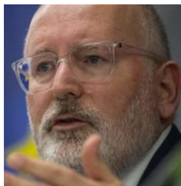
Commission Vice-president Frans Timmermans