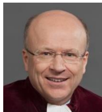
President European Court Koen Lenaerts